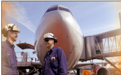
Aviation And Airline Industries