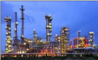
Oil And Gas Refineries