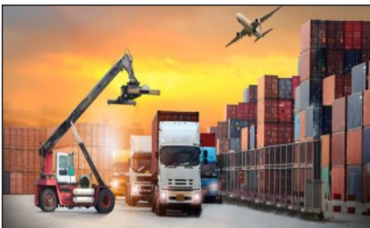
Transport & Export Sector