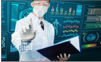
Medical Science & Health care