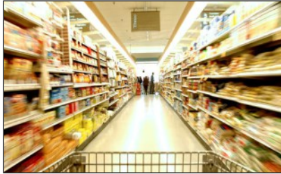
FMCG, Hospitality Sectors