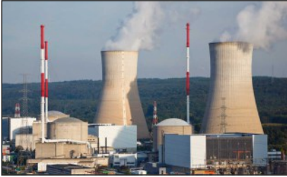
Electric Power Plant And Manufacturing