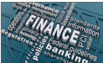
Banking/ Finance & Insurance